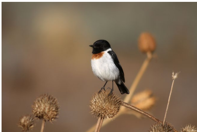
FIGURE 1 Adult male African stonechat

Here, we compare telomere length of two closely related sister taxa of stonechats, Saxicola torquatus axillaris (Figure 1) and Saxicola rubicola that breed in tropical and temperate environments, respectively (Doren et al., 2017; Urquhart, 2002). At all latitudes, stonechats are socially monogamous, open habitat, insectivorous passerines that aggressively defend breeding territories (Apfelbeck, Mortega, Flinks, Illera, & Helm, 2017). However, they vary in pace of life according to their environment (Ricklefs & Wikelski, 2002). Stonechats show a latitudinal cline in metabolic rate, with genetically inherited, higher metabolic rates in higher-latitude populations (Klaassen, 1995; Tieleman et al., 2009; Versteegh, Schwabl, Jaquier, & Tieleman, 2012; Wikelski, Spinney, Schelsky, Scheuerlein, & Gwinner, 2003). Further, temperate stonechats have a genetically fixed larger clutch size than tropical ones (Gwinner, König, & Haley, 1995), and their higher fecundity correlates with elevated baseline corticosterone concentrations during the breeding season (Apfelbeck, Helm, et al., 2017). In agreement with lower adult extrinsic mortality in tropical environments, local survival of tropical stonechats appears to be much higher than that of temperate